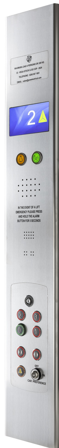
Half height side-hinged operating panels available in widths more than 130mm