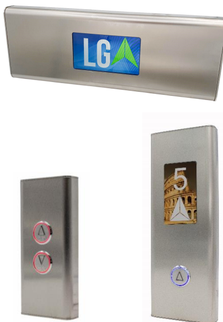
Standard or with integrated indicator